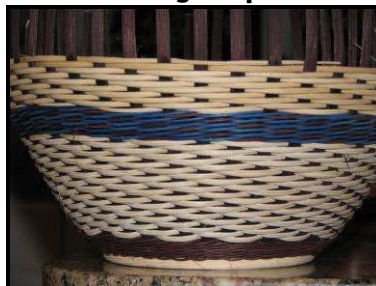
Weaving complete and mold removed