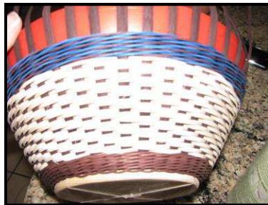
6 rows of triple twining complete