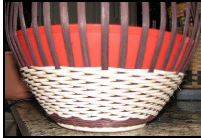
After weaving 23 rows of O2/U1